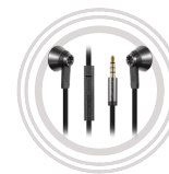
Lenovo™ 500 Extra Bass In-ear Headphones