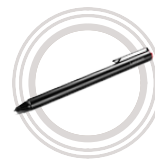
Lenovo™ Active Pen