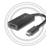
Lenovo™ USB-C Adapter

* Example of Lenovo™ Miix catalogue naming convention